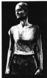
Nan S. Smith Observer , Searching For The True Self II, 1993. Glazed earthenware. 35" x 19" x 11" Observer , Searching For The True Self I, 1993. Glazed earthenware. 35" x 19" x 11" (L) Release , 1994. Underglazed and glazed earthenware on pleksi-glass. 23.5" x 17" x 1" (L)