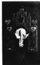
Chris Spanovich Winged Woman , 1994. Earthenware clay & cottonwood sticks 19-1/4" x 13.5" x 2" (L) Deity The Dancer , 1994. Earthenware clay and cottonwood sticks 19.5" x 13" x 2" (L)